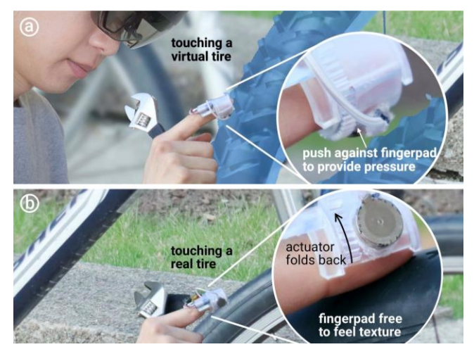
Figure 4: This approach enables a user in Mixed Reality to feel the texture of a virtual tire; yet they are also able to feel the texture of a real tire when they touch it, because the device folds back and reveals the whole fingerpad.

By folding away, more bulky actuators can be integrated onto the device. This approach can be extended beyond pressure feedback to include other sensations, such as temperature (e.g., via Peltier elements).