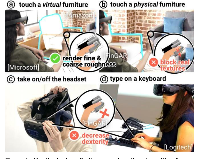
Figure 1: Haptic devices limit users when they transition from virtual-to-physical interactions: (b) haptic devices prevent the user from interacting with physical objects (e.g., furniture), and (c, d) degrade the user's dexterity while operating other devices (e.g., headsets or keyboards).

The advancement of immersive headsets opens up new usage scenarios such as Augmented Reality; yet, traditional haptic devices conflict with these. Not only their current designs were not for them, the more advanced these haptic devices are, the more conflicts. Here, we illustrate the problem with the traditional haptics approach with some examples of immersive experiences: